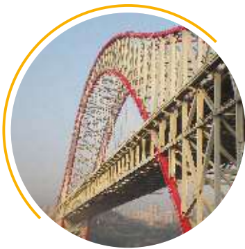
Highways & Bridges

Jotun works closely with all industries to provide reliable solutions and in our continuous efforts to further meet the challenges in protecting steel structures we have developed innovative, lasting and economic systems for virtually any scenario.