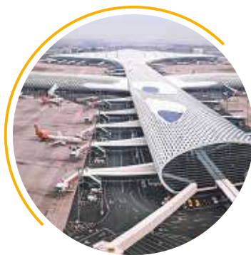
Airports & Ports